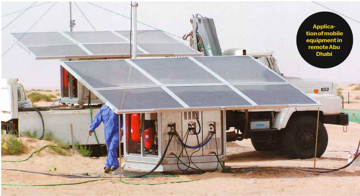
Applica- tion of mobile equipment in remote Abu Dhabi

“Within the industrial sector, EMRA is positioned to meet specific water requirements through state of the art reverse osmosis portable equipment.”