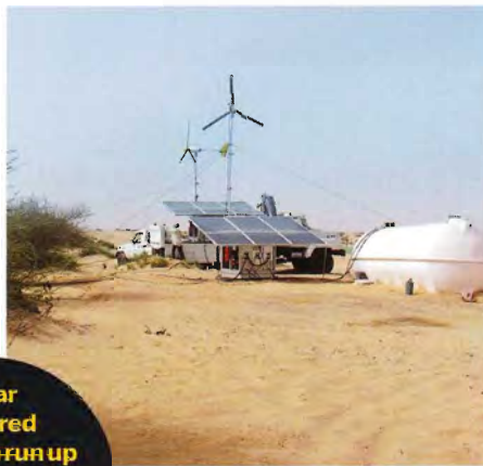
Solar powered units can run up to 24 hours with- out ongoing fuel and transporta- tion costs

The reverse osmosis system stands out for its robust construction and is designed to conservative standards for versatility in the event of feed water quality and temperature variations. All of Axeon system designs